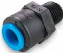
Kynar Check Valve