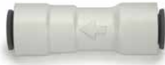
LIQUIfit™ Check Valve