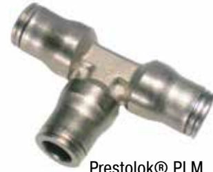
Prestolok® PLM Electroless Nickel Plated

Complete offering of metal flow controls and function fittings