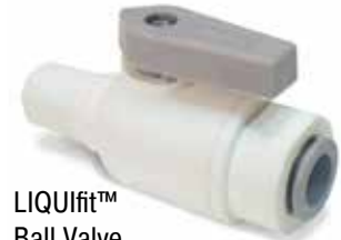
LIQUIfit™ Ball Valve