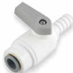
Polypropylene Ball Valve