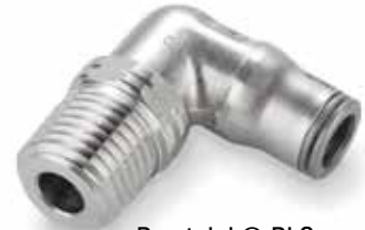
Prestolok® PLS Stainless Steel